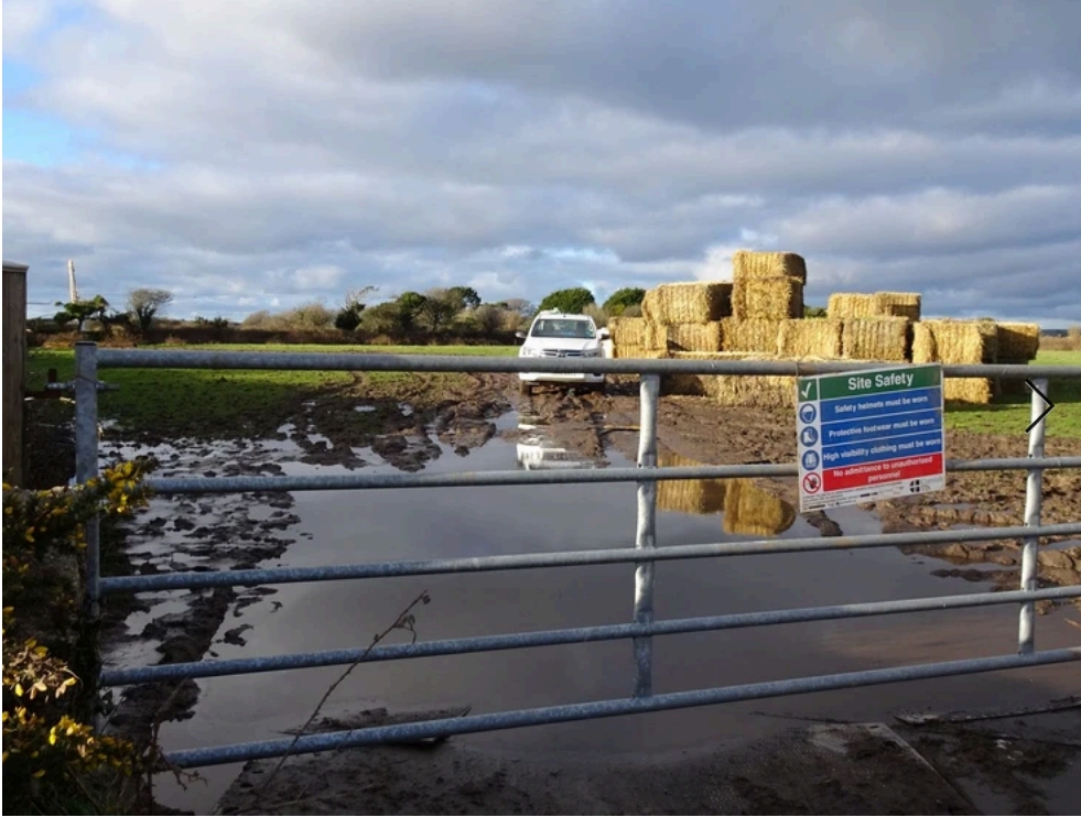
Images of the new drill site at PV207 off Black Lane

It is not unusual to feel pressured when communications are by phone or in person and, as this decision has potentially far-reaching consequences, it is better to be in possession of all the facts. Bear in mind these companies have a strong incentive to show you only the up-side and to push you to decide quickly...