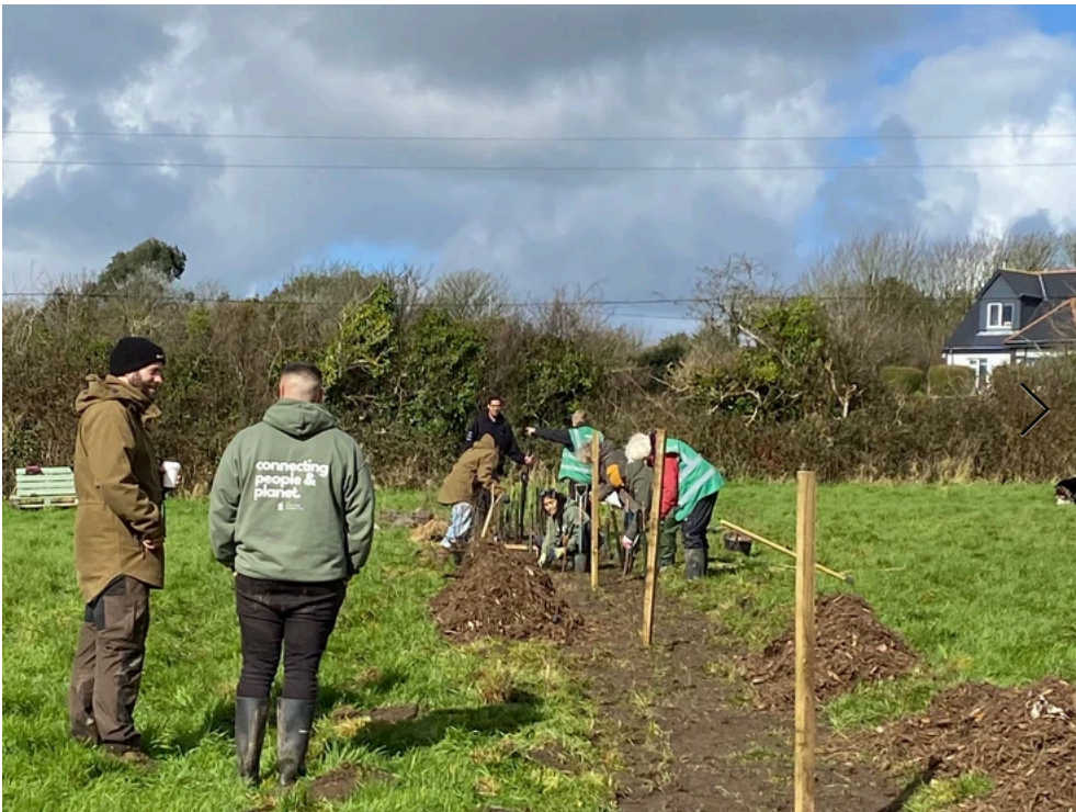
Photos of the tree planting event held at Lottie's Farm

Members of the group and the wider community enjoyed a great day out helping the environment at a recent local tree planting event at which over 400 trees were planted, with an eventual aim of planting a further 600 plus and creating a welcoming natural space for members of the community. The event was organised in conjunction with the owners of Lottie's Farm , The Uearth Project and Plant One Cornwall