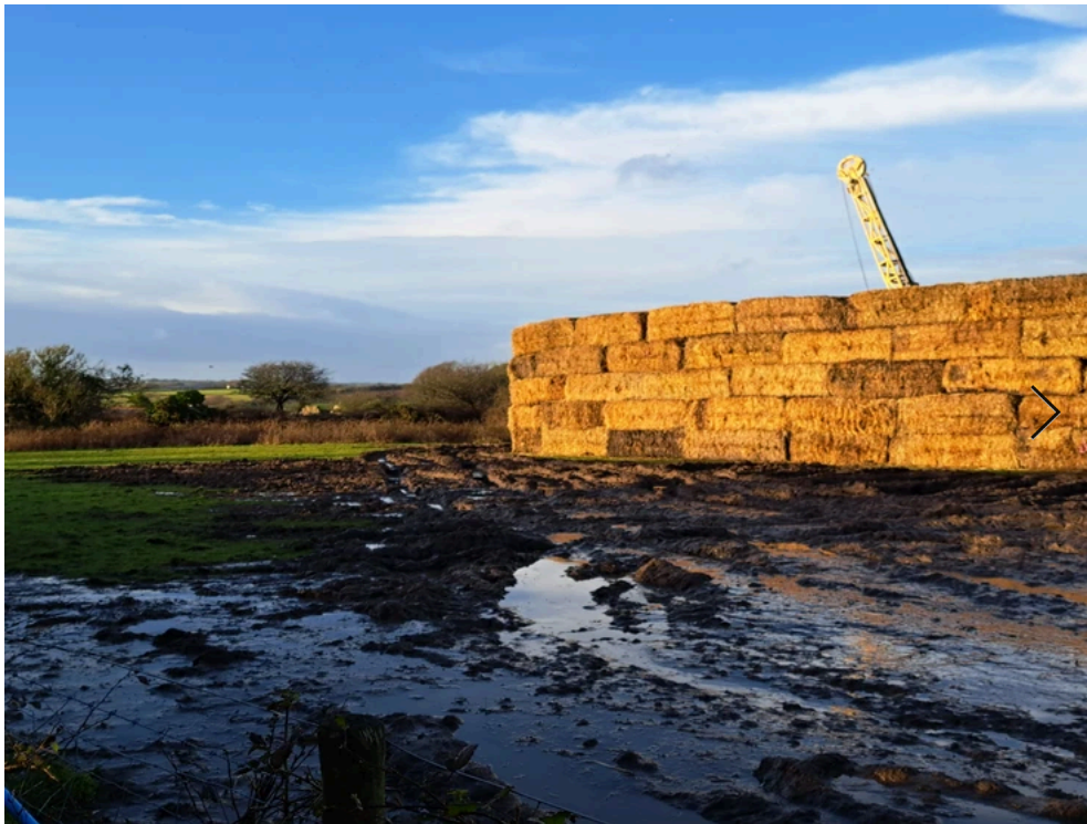
Heavy plant plus lots of rain = Mud! Cornish Tin setting up at sites 23/107 & PV207

Cornish Tin have started the third phase of their exploratory drilling campaign. Given the recent wet weather the heavy plant movements for moving all their equipment in has, of course, created a mud bath in the fields they are currently operating in.